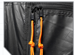
HEAVY-DUTY SBS DOUBLE ZIPPERS