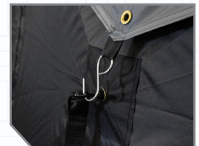
RAINFLY HOOKS TO TENT WALL ANCHOR POINT