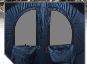
BREATHABLE MESH WINDOWS