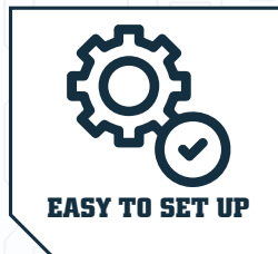
EASY TO SET UP